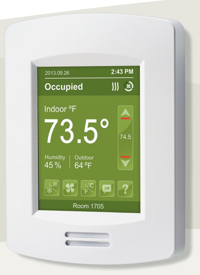
VT8300 Room Temperature Controller

Display your own logo and custom messages on configurable color screen to reinforce your brand and provide a more enjoyable occupant experience.